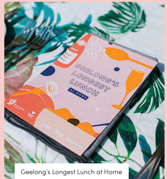
Geelong's Longest Lunch at Home