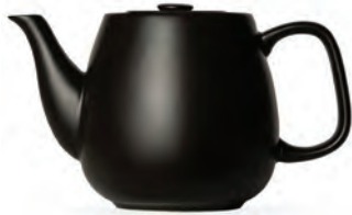
T2 Hugo teapot $40

Did you know when you shop at barwongifts.com.au 100% of proceeds support Barwon Health?