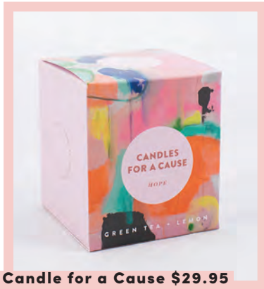
Candle for a Cause $29.95