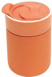
Ceramic Care Cup $22.95