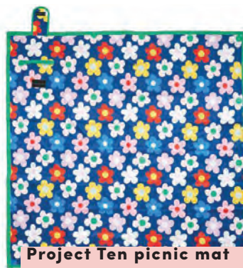
Project Ten picnic mat $89.95