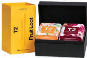
T2 Icon Duo Gift Pack - Fruit Loot $30