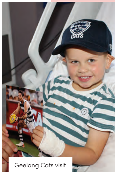
Geelong Cats visit