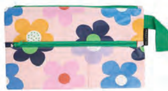
Project Ten pencil case $14.95