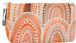
Small cosmetic bag $18.95