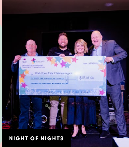
NIGHT OF NIGHTS