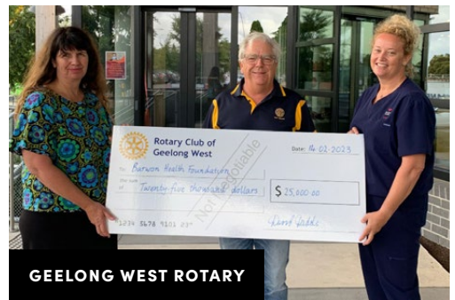
GEELONG WEST ROTARY