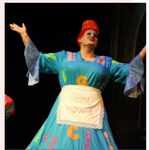
MEDIMIME FUN OVER THE YEARS