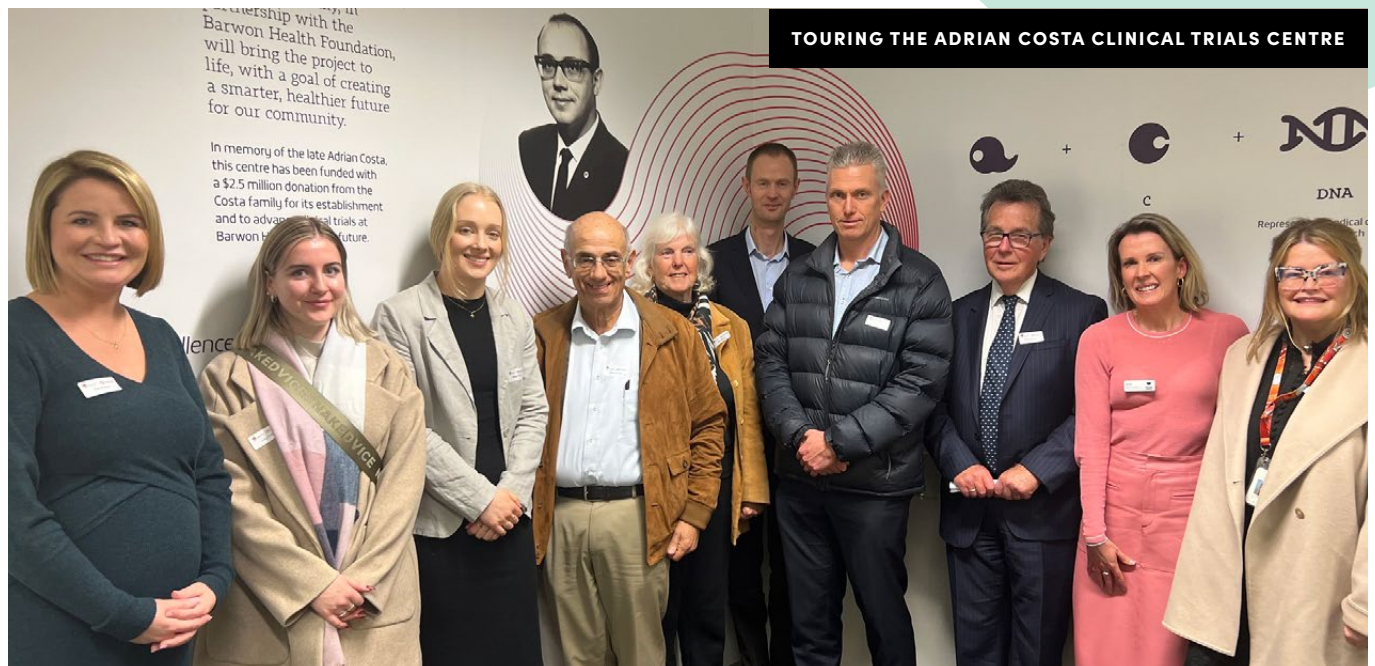
TOURING THE ADRIAN COSTA CLINICAL TRIALS CENTRE

HERE'S JUST ONE STORY ABOUT THE AMAZING WORK TAKING PLACE AT THE ADRIAN COSTA CLINICAL TRIALS CENTRE.