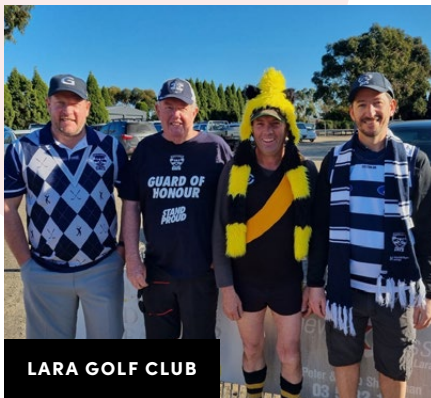
LARA GOLF CLUB