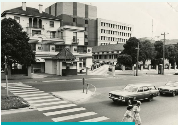
THE GEELONG HOSPITAL C.1970