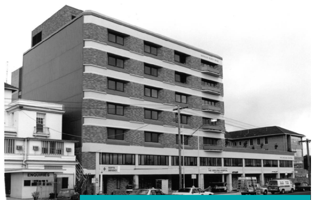
THE GEELONG HOSPITAL APPROX .1986