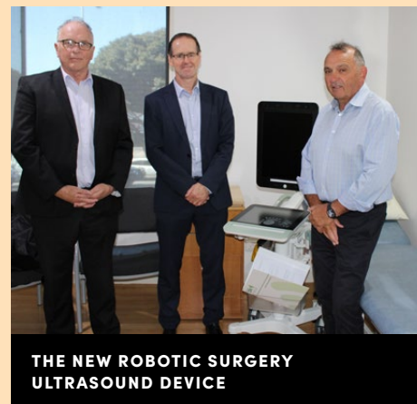
THE NEW ROBOTIC SURGERY ULTRASOUND DEVICE