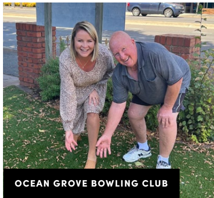
OCEAN GROVE BOWLING CLUB