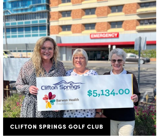
CLIFTON SPRINGS GOLF CLUB

Every year we see book fairs, golfing competitions, footy colours days and more held across the local region to give back to the health service that cares for so many. We're shining the spotlight on a small snapshot of community heroes we were so fortunate to have support us in 2023.